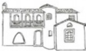
Spanish Colonial Revival