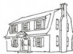
Dutch Colonial Revival