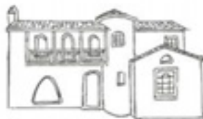
Spanish Colonial Revival